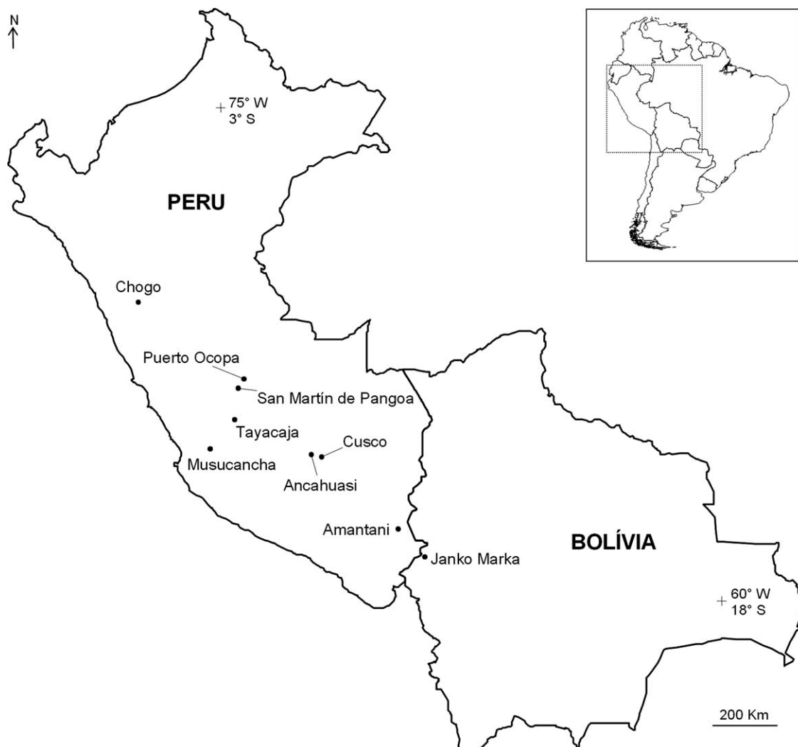
Fig. 2. Sample locations for individuals bearing the derived allele at marker SA01.

a Codes for haplotypes found in South American populations: JMK, Janko Marka, Bolivia ( n = 1 ); AMT, Amantani, Peru ( n = 1 ); CHG, Chogo, Peru ( n = 6 ); SMP, San Martín de Pangoa, Peru ( n = 1 ); CUS, Cusco, Peru ( n = 1 ); ANC, Ancahuasi, Peru ( n = 1 ); TAY, Tayacaja, Peru ( n = 2 ); MUS, Musucanacha, Peru ( n = 2 ); POC, Puerto Ocopa, Peru ( n = 1 ). See Figure 2 for sample locations. b DYS389a-b: Allele designations according to Tarazona-Santos et al. (2001).